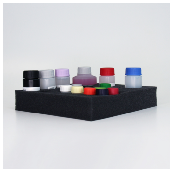
Serotonin ELISA kit