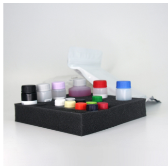
Serotonin ELISA kit

Standard curve - to be generated every time the assay is performed.