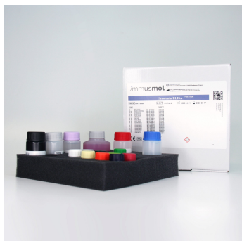
Serotonin ELISA kit