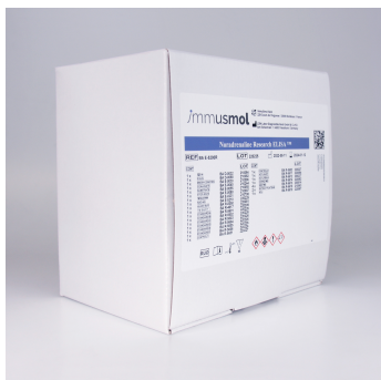
Noradrenaline Research ELISA kit