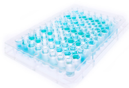
Fast ELISA kit for histamine monitoring in fish samples