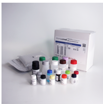
5-HIAA Elisa kit