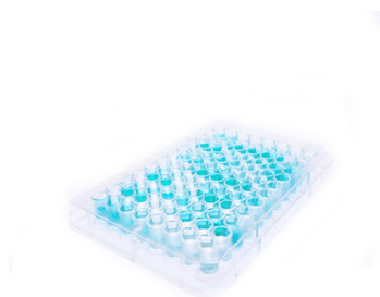
Plasma Norepinephrine ELISA kit